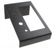
Dual Desk Stand