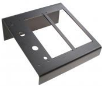
Triple Desk Stand