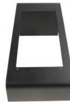
Single Desk Stand